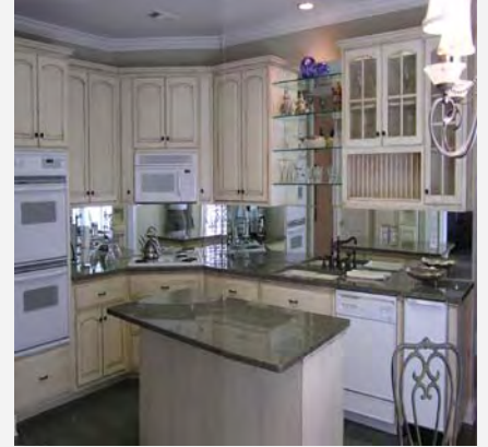
Kitchen 12.10' X 13.0'